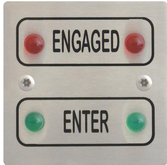
Overdoor Indicator 9090.06

ALLOWS OCCUPANTS TO SIGNAL ROOM OCCUPANCY TO HELP MAINTAIN PRIVACY / SECURITY